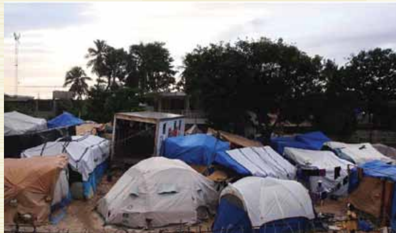
Make-shift tent settlement in Port-au-Prince