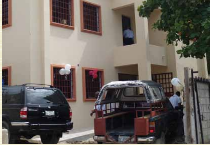
World Renew assisted its long-time partner, PWOFOOD, in rebuilding their office space

During 2012, World Renew partnered with the local Mayor's office to provide a temporary rental subsidy