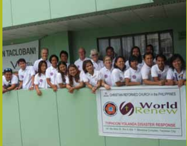
Guiuan & Tacloban team