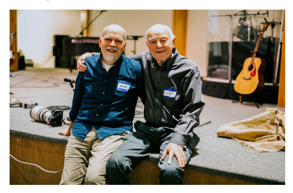
m. Sponsoring Group Completes First CG Readiness Call with World Renew

and applies these requirements. World Renew and sponsoring groups must comply with all the requirements contained in this document.